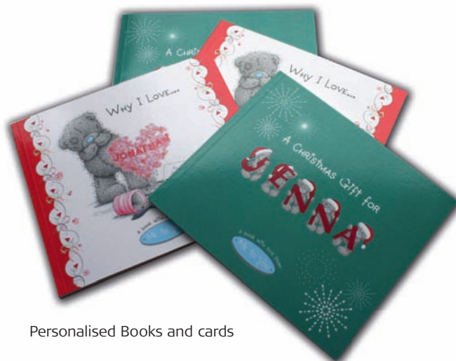
Personalised Books and cards